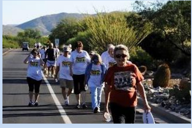
Walking and Talking Along Ridgeview