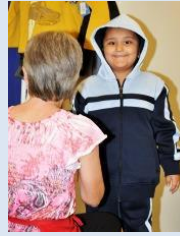
Winter Jacket and Books, Too!