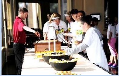
Hot Breakfast with Friends (Your Tee Shirt Is Your Ticket)