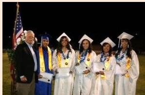
2015 Scholarship Winners