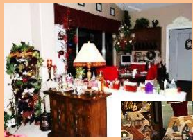
Holiday Decorated Homes