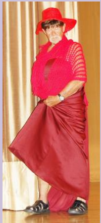
Fashion and FUN!