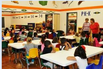
Kids Wait Their Turn