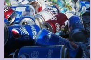
Aluminum Cans Recycling