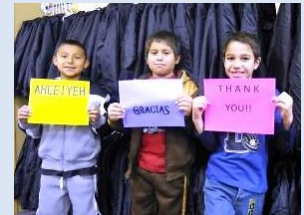
AHEEYEH GRACIAS THANK YOU!!