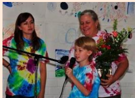
College for Kids