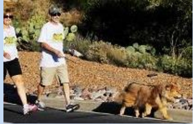
Pets Are Welcome