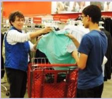
Clothes for Teens